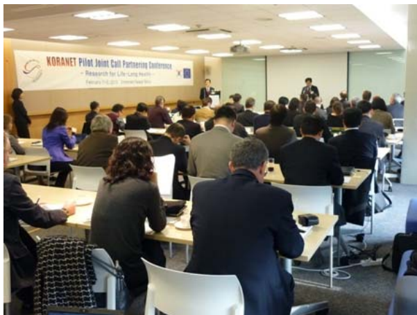
Participants of the Partnering Event

The aim of this event was to give researchers from Europe and Korea who are active in the field of Life-long Health the chance to meet, present and discuss their work and - if possible - already start forming consortia to submit a project proposal for the KORANET Pilot Joint Call (PJC).