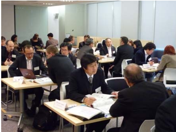
Participants of the face-2-face networking sessions