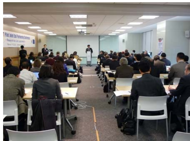
Participants of the Partnering Event

Around 30 speakers from Korea and several European countries were invited. Speakers came from different scientific disciplines ranging from health research to technologies and social sciences. Overall, more than 100 researchers participated in the event, most of them from Korea.